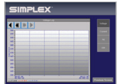
Metering Trends Screen