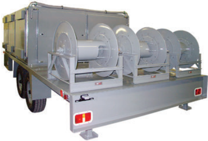
Bottom Photo: Optional full enclosure with lockable doors for cable reels.